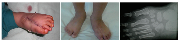
Figure 4: Case 2, Surgical figures and final shape. a) Central ray resection; b, c) Foot shape and radiograph (with extra cuneiform) 3 years after surgery

focusing on different tarsal bone variations. The mirror foot has been also classified similar to the mirror hand classification of Al-Qattan et al. 19 by Fukazawa et al. 20