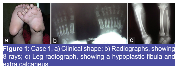
Figure 1: Case 1, a) Clinical shape; b) Radiographs, showing 8 rays; c) Leg radiograph, showing a hypoplastic fibula and extra calcaneus.

A 15-month-old boy presented with 8 rays. Similar to the first case, his history revealed parental consanguinity, no family history, and no history of drug or radiation exposure during gestation. Hindfoot tarsal duplication was not