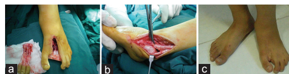
Figure 2: Case 1, Surgical figures (a and b) and final shape (c) are shown.

There have been different classification systems for foot polydactyly. The location of the duplication could be postaxial, preaxial, or central. The central type accounts for only 6% of foot polydactyl cases. 6 The classification on the basis of the fifth and first metatarsal morphologies was used by Venn–Watson, 17 who found 6 different variations in metatarsal shapes, while Watanabe et al. 18 recognized 3 groups when