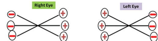
Figure 3: Shows extra-ocular movements; It can be seen from this chart that the limitations of eye movements were confined to abduction in both the eyes.

and was discharged on the eleventh day after admission.