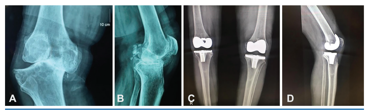
Figure 2: A 75-years-old man with knee osteoarthritis, subluxated knee, and major tibial defect on the right side was managed without a metal wedge or stem, but only with the lateral placement of tibial component and use of tibial plate size 3 instead of size 4 plate to match the size of D femur. A and B: Pre-operative Knee Radiographs show about two-thirds of the medial plateau is depressed with about 17 mm of depth, with good supra-tubercle bone stock. C and D: Post-operative radiographs with reconstruction of the tibial defects. The right side required about 2 cm lateral placement of the tibial component.