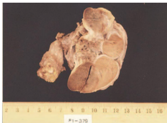
Figure 2: Gross specimen showing discontinuous splenogonadal fusion.

Although tumor markers such as chorionic gonadotropin hormone and \alpha -fetoprotein (AFP) levels were normal, the patient was recommended for left orchiectomy with suspicion of malignant tumor. After preparation, he underwent left inguinal exploration and there was a firmly dark red mass attached by sharp margins to testis with a thick fibrous band and there was no connection between the spleen and the mass (figure 2).