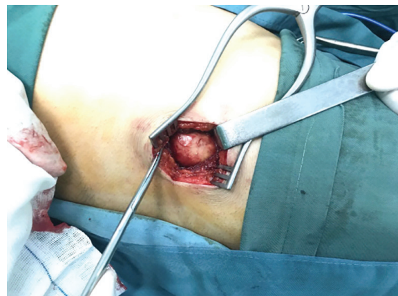
Figure 2: Thoracic wall mass was observed during surgery.

showed that the thoracic wall mass extended to the posterior abdominal wall and was entirely extrapulmonary and extraperitoneal (figure 2). Subsequently, all cystic structures of the thoracic wall and intrathoracic region were removed and the primary defect was reconstructed. Histopathological examination of the resected sample indicated HC. The postoperative period was uneventful and the patient was discharged two days after the surgery and had a good recovery. Albendazole 400 mg (Mediva Lifecare, Haryana, India) was prescribed for four weeks postoperatively. During 2 years' follow-up, there were no complications nor any signs of recurrence. Written informed consent was obtained from the patient for the publication of the present case report.