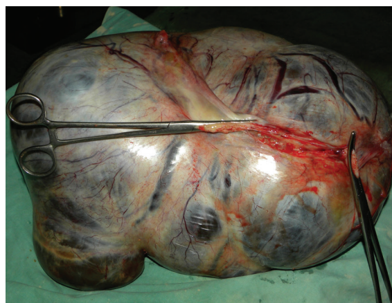
Figure 2: This cystic mass (approximately 40 cm×30 cm×25 cm in size, pinkish in color, and with a smooth surface) arising from the right ovary was removed via laparotomy.

abdomen after vaginal delivery. After proper counseling, decision for laparotomy was taken in the postpartum period. All the preoperative investigations were within normal limits. On the 8 th postpartum day, laparotomy was performed under general anesthesia. A cystic mass (approximately 40 cm×30 cm×25 cm in size, pinkish in color, and with a smooth surface) arising from the right ovary was found. The left fallopian tube and ovary was healthy. The right ovary, along with the mass and fallopian tube, was removed. Infracolic omentectomy and left tubectomy was done (as per patient and her husband's consent). The intact cyst was multiloculated, weighed 11,000 gm, and was filled with fluid. Figure 2 demonstrates the cystic mass after it was removed via laparotomy. There was mild omental adhesion, but no ascites was observed. Specimens and peritoneal washing were sent for histopathology examination. The intraoperative and postoperative periods were uneventful, and she was discharged on the 8 th postoperative day. In subsequent follow-up, no abnormality was detected.