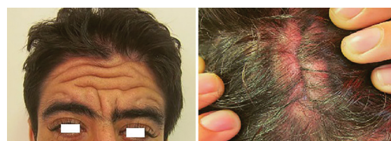
Figure 3: Pronounced forehead skin folds, prominent nasolabial folds, and cutis verticis gyrata in association with lengthened eyelashes.