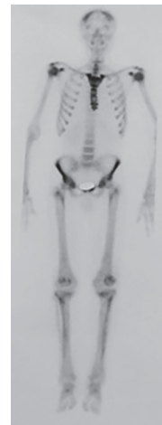
Figure 4: Whole body bone scan, TC 99m-MDP show diffusely uptake throughout the skeleton.

associated with inflammatory bowel disease (IBD). For the evaluation of secondary HOA, physical examination, laboratory tests, and investigation of images did not reveal any particular problems. On the other hand, spondyloarthropathies associated with IBD did not match with skin manifestation. Disease inheritance patterns are different. 1 Other family members were not involved in this case and it might be due to autosomal recessive inheritance or incomplete penetrance and variable expression in parents.