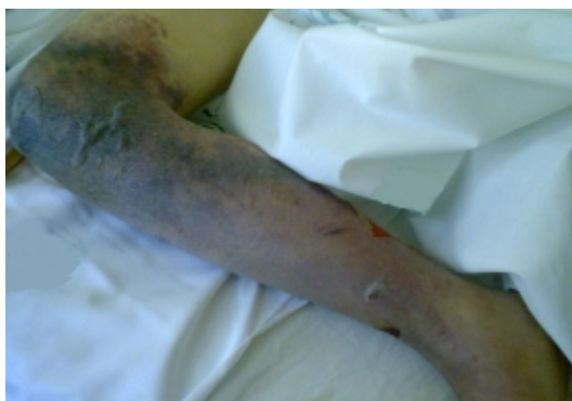
Figure 2: Irreversible ischemia of right limb.