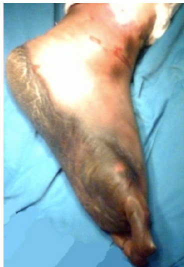
Figure 3: Irreversible ischemia of left limb.

Increased coagulability is a rare but well-recognized feature that complicates inflammatory bowel disease. Thrombotic complications are usually the result of pro-coagulant changes