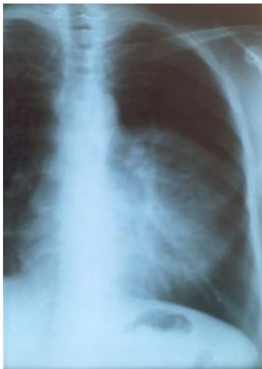
Fig 1: Chest X-ray showing opacification in the lingual and left upper lobe

thoracotomy and a LUL with lingula lobectomy. Pathologic examination of the mass revealed benign sclerosing hemangioma of the lung. (Fig 2)