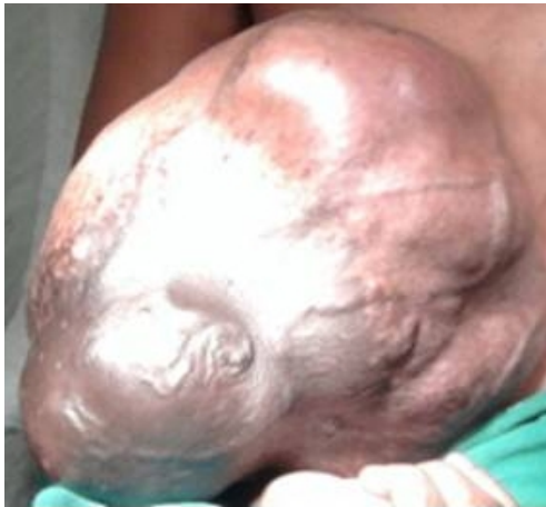
Figure 1: Huge lump in breast of the patients with malignant phylloides tumor during pregnancy.

her description till the 28 th week of her pregnancy. It began to grow rapidly in size, practically in days, and at the time of presentation was as large as a football (figure 1), and was causing pain for the patient. Examination revealed a characteristically ill-shaped swelling with variegated consistency. It was so large and heavy that required the support by her hands during moving around (figure 1). The axillae and opposite breast revealed no significant findings. The patient had also a uterine prolapse since few days after marriage (figure 2). Fine needle aspiration cytology was positive for malignancy, chest X-ray with shield was normal, and ultrasonography of abdomen for metastases was normal.