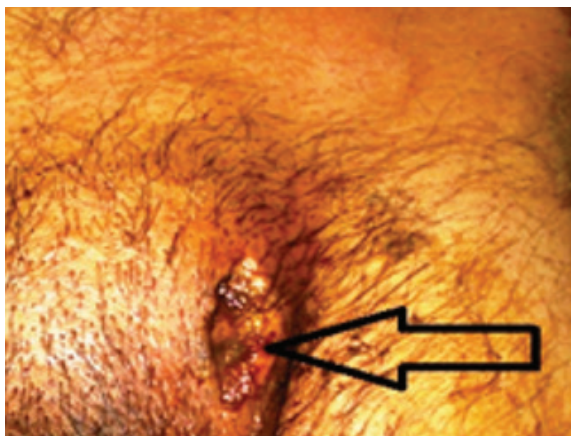
Figure 1: fecal fistula in the left suprapubic region.

A 55-year-old man presented to the emergency department of J.N. Medical College in February 2012, with a history of discharge of fecal matter along with pain and redness at the left extreme of the suprapubic region of 5 days' duration (figures 1 and 2). There was no history suggestive of an inguinal hernia in the past, and nor was there a history of any type of surgical intervention.