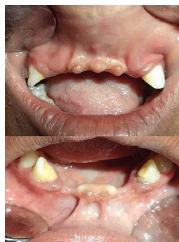
Figure 2: Shows intraoral findings of the patient. Multiple accessory maxillary and mandibular labial frenula with upper (class III) and lower lip tie, absence of the mucobuccal fold and the resultant reduced maxillary and mandibular labial sulcular depth. Multiple longitudinal serrations, traversing the width of the maxillary and mandibular anterior alveolar ridges. Missing maxillary and mandibular incisors.

the associated relative mandibular prognathism. The radiographs of the upper limbs displayed the following features: curving of the humerus bones bilaterally, underdeveloped styloid process of the ulna bilaterally, postaxial polydactyly and clinodactyly bilaterally, hyperplastic capitae of the left wrist, undeveloped metacarpal for the extra digit in the left hand, and hypoplastic hamate of the right wrist. The radiographs of the lower limbs showed the following features: short