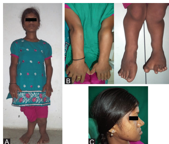
Figure 1: Shows general features of the patient. A) Short stature, mesomorphism, and narrow thorax. B) Upper and lower limbs show progressive shortening (from the proximal to the distal portions), with bowing of the arms and legs and "knock-knees" (genu valgum), along with the absence of hair on the arms and legs. Clinodactyly of the digits of both hands and the great toe of the right foot, sausage-shaped digits of both hands, postaxial polydactyly (hexadactyly) in both hands and left foot, and short and dystrophic nails (of both hands and toes). C) Normal head morphology with mild maxillary hypoplasia and the resultant relative mandibular prognathism.

Thereafter, numerous radiographic investigations were carried out for the patient, comprised of orthopantomography and lateral cephalography, along with radiography of the upper and lower limbs and a posteroanterior view of the chest. The orthopantomograph revealed the absence of maxillary and mandibular incisors with the absence of developing/developed permanent teeth buds of the same. The lateral cephalogram confirmed the hypoplasia of the mid-facial region along with