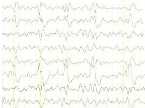
Figure 1: Generalized periodic sharp & slow waves at 1 to 1.2 CPS with diffuse slowing background.

signs of atrial fibrillation, ST depression, and T inversion in pericardial leads. Brain computed tomography (CT) demonstrated mild atrophy and a small hypodense lesion in the right parietooccipital region with no contrast enhancement and no mass effect, probably because of an old ischemia. Electroencephalography (EEG) demonstrated diffuse slowing with periodic complexes of sharp and slow waves discharges of 1 to 1.2 per seconds (figure 1), which can be seen in typical cases of CJD.