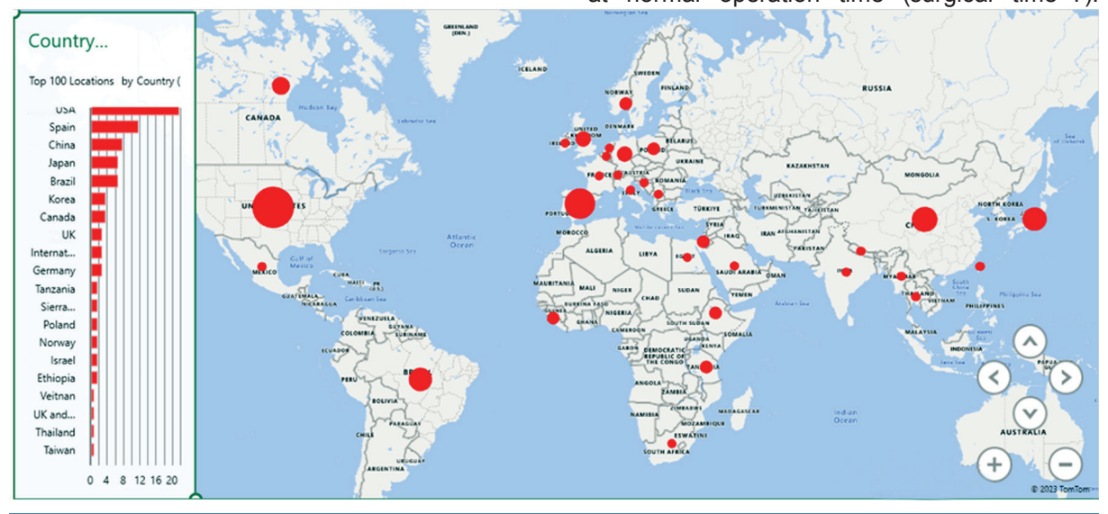
Figure 2: The figure shows the number of studies included in the scoping review from different countries of the world. The larger circles indicate the greather number of articles from that country.

There were differences in the pooled incidence of surgical site infections based on the type of surgical procedure, from a lower range of 2.5 (95% CI: 1.18-5.25) for cholecystectomy to a higher range of 27.4 (95% CI: 20.76-35.31) for liver transplantation (supplementary file 3). The meta-regression results indicated that the type of surgery procedures accounted for 31.17% of the heterogeneity (supplementary file 4). The pooled incidence of SSI was up to 14.1 (95% CI: 10.0-18.64) during longer operation (surgical time≥T) compared to 7.2 (95% CI: 5.04-10.30) at normal operation time (surgical time<T).