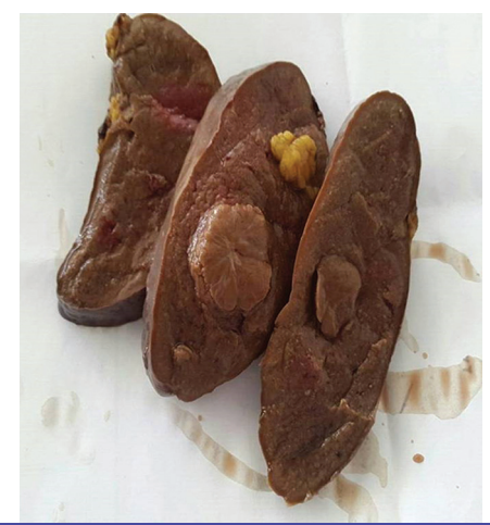
Figure 2: Gross of the spleen shows a well-defined 3 cm

angiosarcoma. This tumor is most commonly seen in the soft tissue and subcutaneous tissue.<sup>2</sup> However, this tumor can also be seen in the liver, lung and other visceral organs, but the behavior and clinical characteristics of the tumor in these two locations are completely different.<sup>2</sup> This tumor is very rare in the spleen.<sup>3</sup> Splenic angioendothelioma has a wide range of morphologic and biologic behavior, composed of kaposiform, myoid and epithelioid angioendothelioma.<sup>3,4</sup> Among these types, MAE is the least common and 6 cases have been reported in the English literature so far.<sup>5-7</sup>