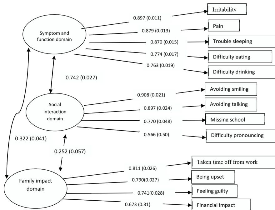
Figure 1: The figure shows the 3-factor model for the Early Childhood Oral Health Impact Scale obtained from confirmatory factor analysis, Estimate (standard error).

Values in boldface indicate loading values of 0.5 or above. Extraction method: Principal component analysis. Rotation method: Varimax with the Kaiser normalization. Rotation converged in 5 iterations