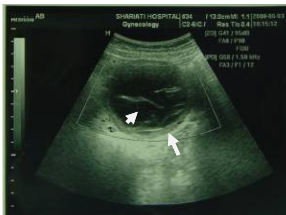
Figure 1: Abdominal ultrasonography image of the omental hydatid cyst. Big arrow shows the double germinal membrane and short arrow shows a single germinal layer.