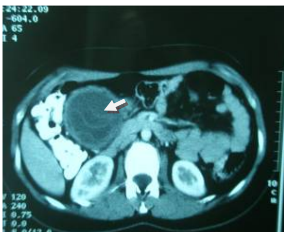
Figure 2: Abdominal CT scan showing a hydatid cyst with laminated layer in front of right kidney.

or change of bowel habit. She had no any specific medical history, except her caesarian section 8 months before.