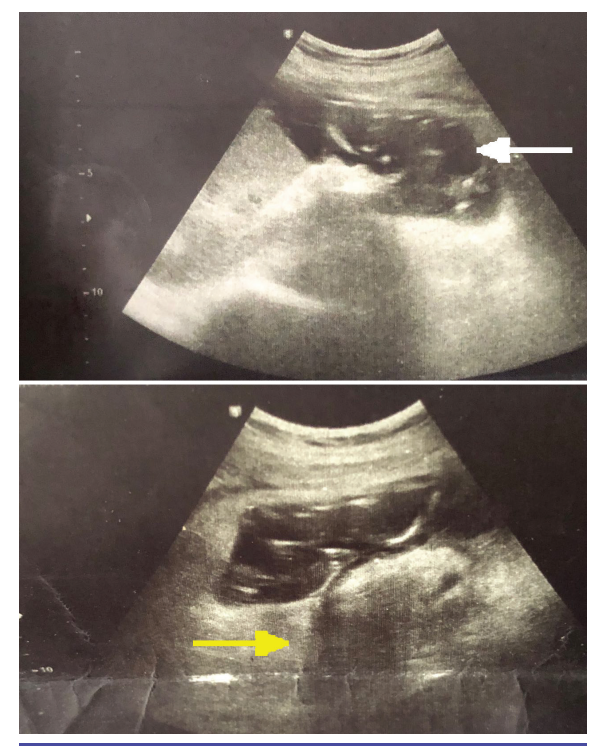
Figure 1: Trans-Abdominal ultrasound shows empty uterus, mild collection and fetus without heartbeat in the left lateral paracolic gutter of the abdominal cavity corresponding to 13 weeks of gestational age (white arrow) and a heterogeneous mass in the left adnexa (yellow arrow).