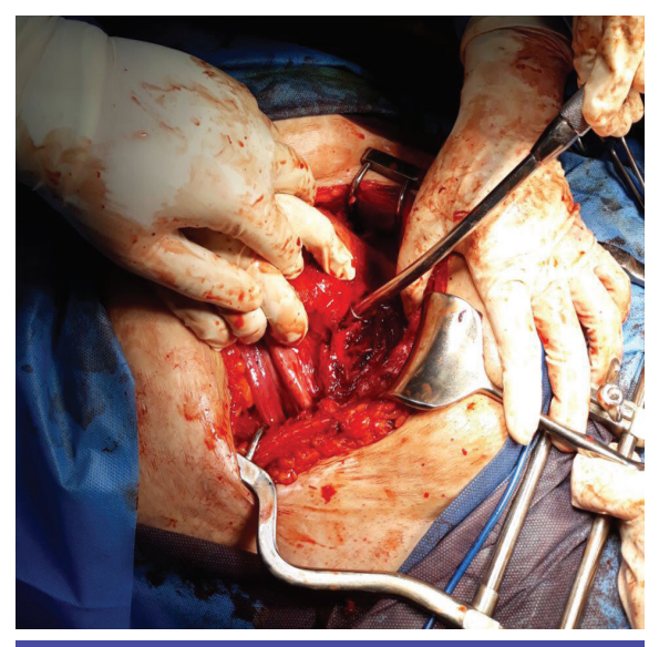
Figure 2: Laparotomy revealed a tear of about 3 cm at the site of previous cesarean scar in a 14-week pregnant uterus; shown by suction head.

were closed in the anatomical plane. There was no medical indication for a blood transfusion nor post-operative complications. Hematinic was prescribed and the patient was discharged 2 days after the surgery. At 6-month follow-up, no specific problems were noted. Written informed consent was obtained from the patient for the publication of this case report.