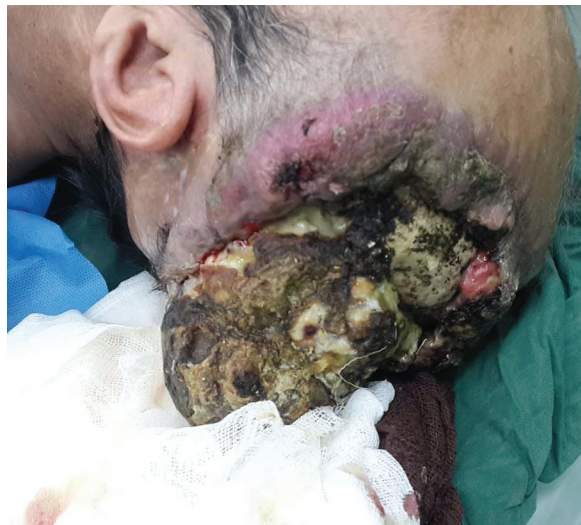
Figure 1: Preoperative photograph of the patient shows an extensive, recurrent, and invasive squamous cell carcinoma of the scalp.

Twelve months later, the patient returned because of the recurrence of the lesion. Rather than heal, the lesion had grown drastically and there were ulcerations and gangrenous discharge. On physical examination, he had aphasia, right-sided paresis, and serosanguinous drainage without signs of infection. Moreover, a lobulated, ulcerated lesion (approximately 20×8 cm) on the inflamed scalp surface with central ulceration was visible (Figure 1).