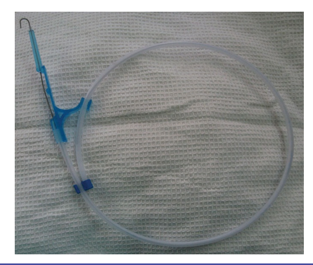
Figure 1: Guide wire «j» tip used for changing the tracheal tube.

The most common cause of reintubation during anesthesia in the operating room is upper airway obstruction and hypoventilation. Endotracheal tube cuff laceration during anesthesia is often associated with respiratory complications, reduction of arterial haemoglobin oxygen saturation, and inappropriate ventilation of the lungs. Therefore, the exchange of endotracheal tube and proper replacement with an adequate tube plays an important role. Care must be taken to reduce neck manipulation, minimize use of laryngoscopy, and cause less sympathetic stimulation. Guide wire "j" tip catheter, which is a central venous catheter, is suggested for the exchange of a tracheal tube during anesthesia without using fiberoptic bronchoscope or laryngoscopy (figure 1).