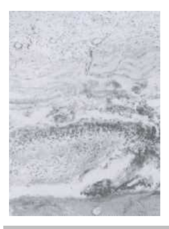
Figure 3: Destructed cartilage with pannus formation, group A. Stained with H & E x 100.

of group A (bacteria-inoculated rabbits without additional treatment). In this group, all joint capsules and peri-articular soft tissues and synovia were highly swollen.