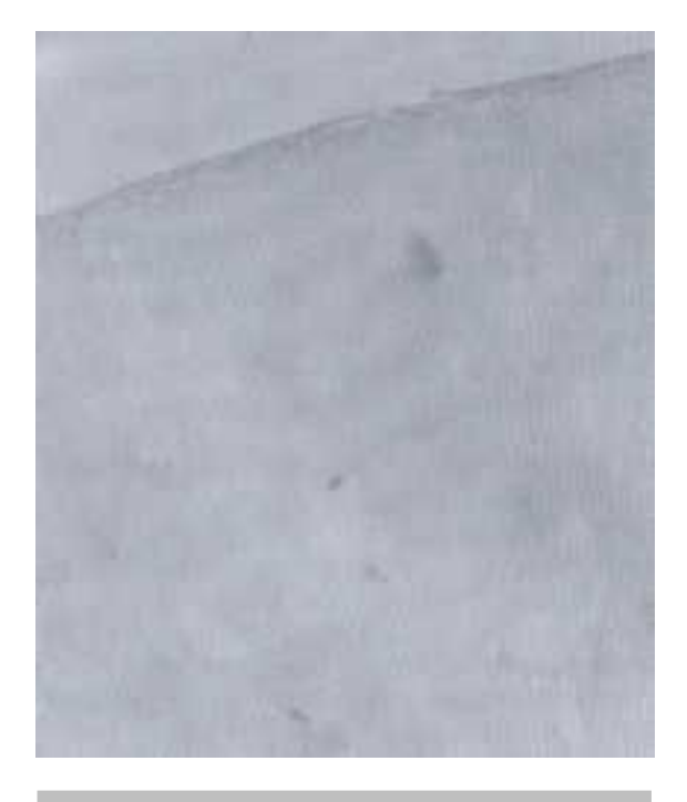
Figure 1 : Normal proteoglycan content in a control knee (non bacteria inoculated). Stained with Alician blue x 100.

Radiological soft tissue scoring was done using the proportion of proximal tibial diameter to adjacent soft tissue diameter on AP films.