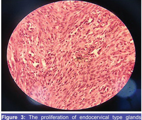
surrounded by stroma rich in smooth muscle with no atypia in the glands and stroma (H&E; ×100 original magnification).

by Gilks and colleagues, reported that most patients did not have any symptoms except for two patients who had abnormal vaginal bleeding.<sup>3</sup> The differential diagnosis included