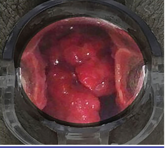
Figure 1: The cervical mass following physical examination.

To date, there have been two case series, each including ten cases, on adenomyomas of endocervical type.<sup>3. 4</sup> The first case series,