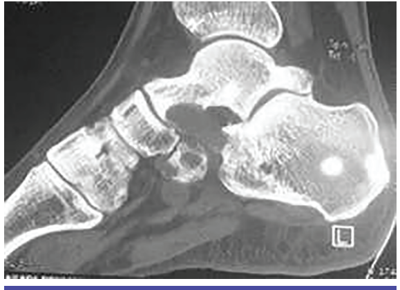
Figure 1: Sagittal plane of the CT-scan shows a soft tissue mass involving talonavicular and talocalcaneal joints that caused bone resorption.

and the patient underwent surgical curettage followed by harvesting autologous bone graft from the iliac crest. As the surgery was carried out at another center, we had no information on the surgical setting, preoperative planning, or the surgeon's decision on the differential diagnoses of the disease. The pathology report indicated synovial cell sarcoma and subsequently the patient underwent chemoradiotherapy.