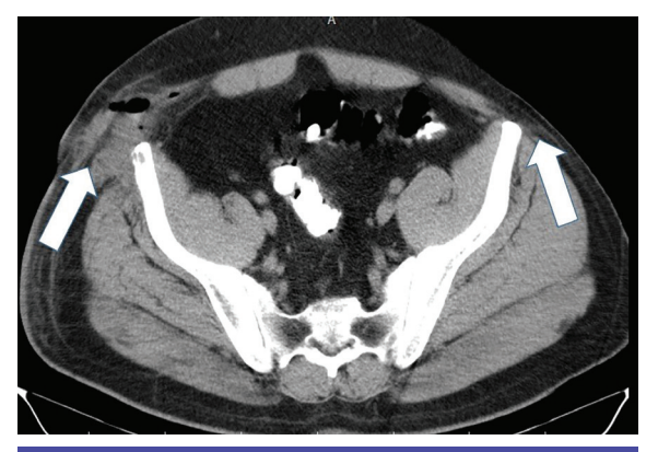
Figure 2: Axial plane of a CT-scan after implantation metastasis of synovial cell sarcoma in the iliac region. Note the soft tissue mass which caused swelling contrasting with the contralateral side (arrows).

Due to postoperative tumor recurrence, the patient was referred to our center. At this stage, knee amputation was suggested. However, the patient rejected this option and requested another tumor excision attempt. We accepted the request conditioned to amputation if a marginfree tumor excision was not possible. Two weeks later, regretfully, we had to perform another operation for a below-the-knee amputation. After