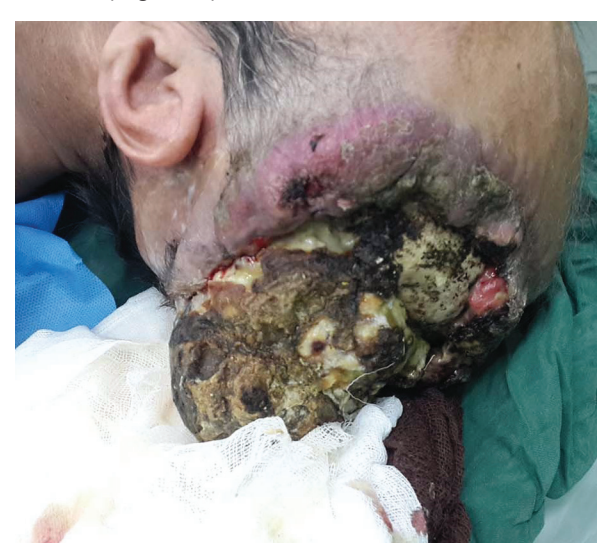
Figure 1: Preoperative photograph of the patient shows an extensive, recurrent, and invasive squamous cell carcinoma of the scalp.

Twelve months later, the patient returned because of the recurrence of the lesion. Rather than heal, the lesion had grown drastically and there were ulcerations and gangrenous discharge. On physical examination, he had aphasia, right-sided paresis, and serosanguinous drainage without signs of infection. Moreover, a lobulated, ulcerated lesion (approximately 20×8 cm) on the inflamed scalp surface with central ulceration was visible (Figure 1).