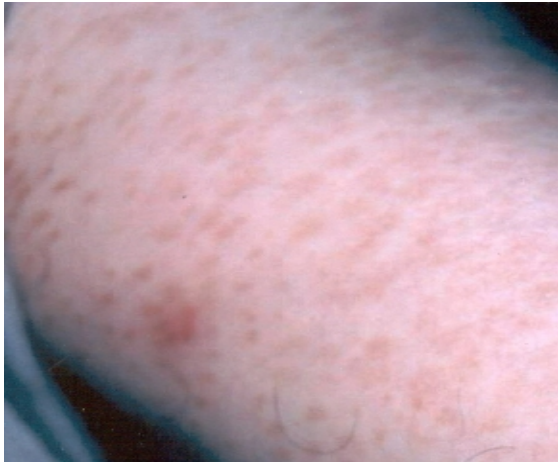
Fig 1: Dermal papules and annular plaques on the forearm

Punch biopsies of the subcutaneous nodules taken from multiple sites revealed collagen degeneration surrounded by epithelioid histiocytes and multinucleated giant cells, as well as increased extracellular mucin, consistent with GA (Fig 2). Both the uveitis and skin lesions responded initially to topical and systemic steroids, but relapsed concurrently during steroid tapering.