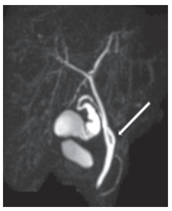
Figure 4: Coronal maximum intensity projection (MIP) reformat reveals a medial spiral insertion to the mid part of the extrahepatic bile duct (EHBD) (arrow).