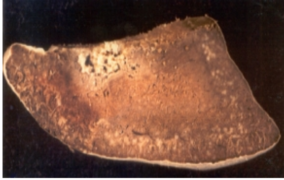
Fig 1: Macroscopic appearance of the splenic abscess in cut section.